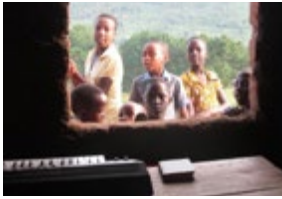
Children look through the open windows of this church in the refugee camp

This particular church in the refugee camp is being pastored by one of our Africa Missions-Rwanda Bible College graduates and has a membership of 250 people! Now the walls are up and the roof is on! There are no windows and they still have a dirt floor. However, when this church starts to worship the Lord, His glory comes down and this building is transformed into a holy sanctuary filled with the presence of the Lord! The people in that church suffered deep trauma. No one in the outside world knew about them or their plight of how they became refugees. Their homes in the DRC were looted and destroyed. Many of their family members were killed in their presence. Many of the women were terribly abused. They fled for their lives—to nowhere! They ended up in this refugee camp. They did find protection and the U.N. meagrely provides for their daily sustenance. But most of all, they found the Lord, the God of all peace and mercy.