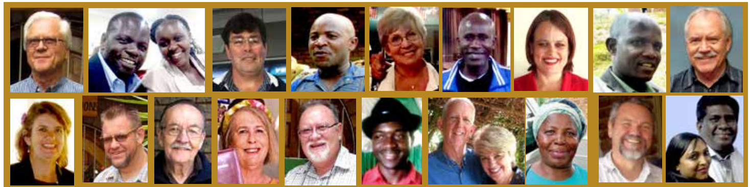
The Africa Missions Team

(Click) I want to DONATE! http://www.africamissions.org.za/contactus.htm Thank you for helping us to spread the Gospel!