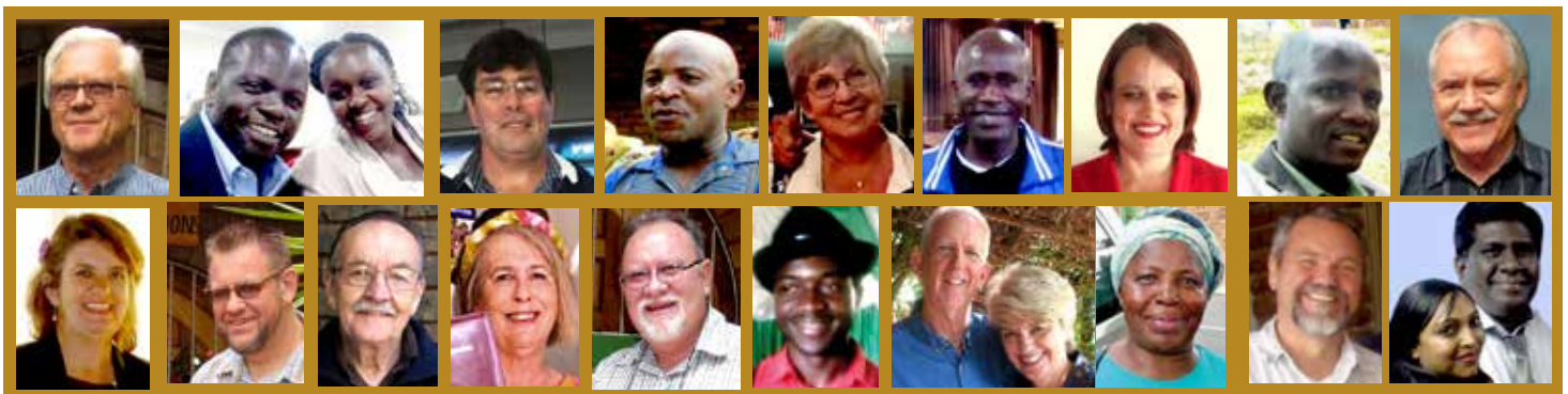
The Africa Missions Team

Thank you for helping us to spread the Gospel!