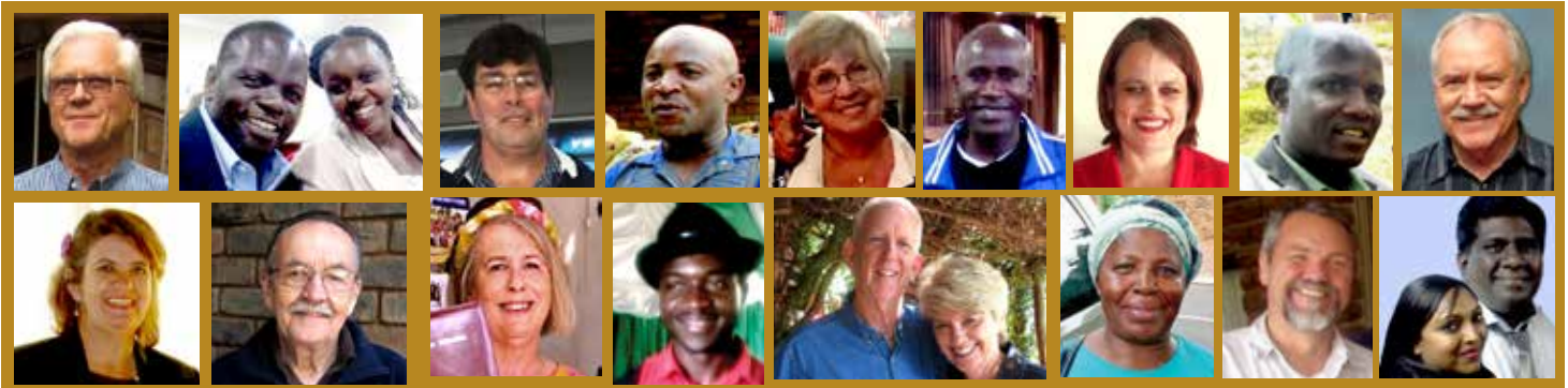
The Africa Missions Team

http://www.africamissions.org.za/contactus.htm